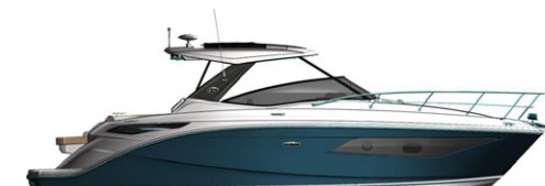
SEA RAY BLUE