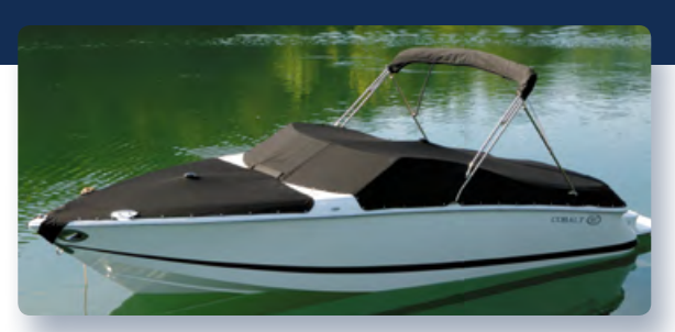
Bow & Cockpit Tonneau Covers