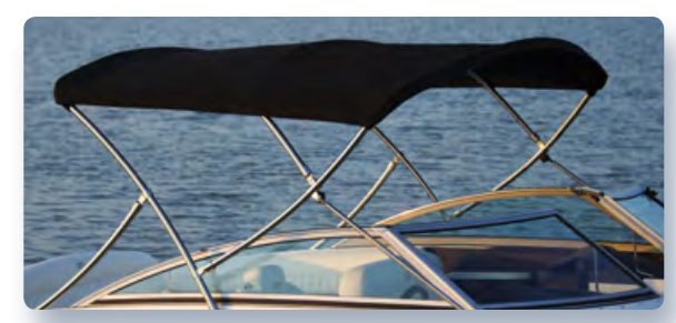
Premium Bimini Top