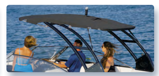
Surf & WSS Folding Arch Bimini Top