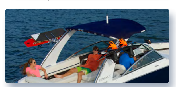
R Models Surf and WSS Arch Bimini Top