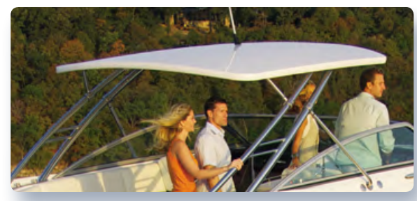
Arch Hard Top